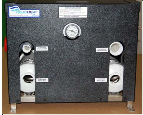
Condenser and Evaporator Water in and outlets